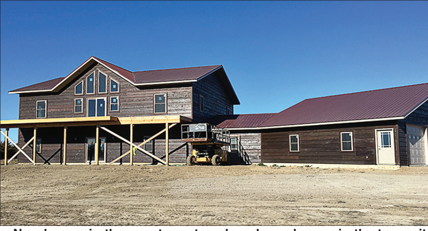
New homes in the country outnumbered new homes in the towns it was discovered as the Clark County Courier tallied the building permits for 2016 last week. This year's annual construction story reports the totals and projects of county residents as they add to their properties.

School has been canceled three times this month already. The weather on page five of the Courier is one to keep, as four times during the middle of the month, the temperature got above freezing. Plus, a bullet was dodged this week, as it seems the 8" to 12" of snow will stay south of our area.